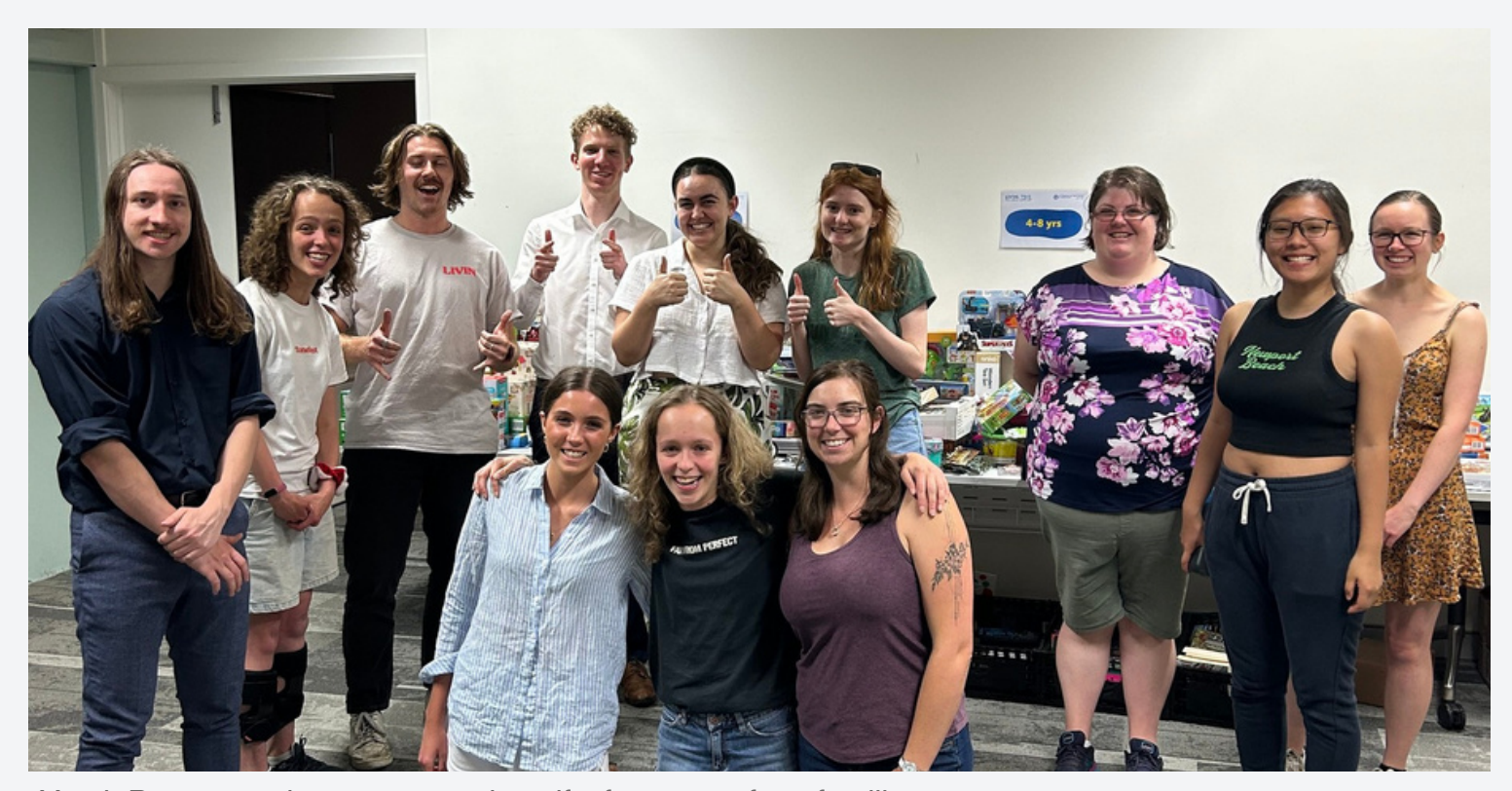
Youth Program volunteers wrapping gifts for some of our families