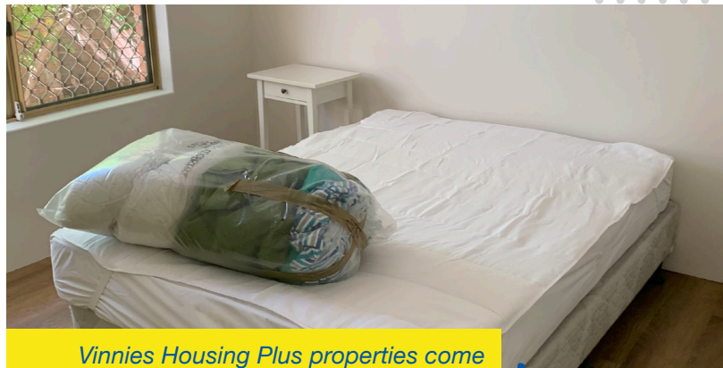
Vinnies Housing Plus properties come fully furnished.

It offers a variety of medium-term housing options in the greater Perth and Mandurah area for families and young people who would otherwise face barriers to housing. Tenants engage with external support workers who help them meet their tenancy responsibilities.