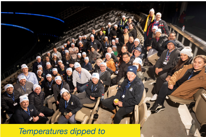
Temperatures dipped to eight degrees at Optus Stadium.

“The advocacy that business and community leaders can do beyond this event can have a lasting impact on the way we respond to homelessness as a society,” she said.