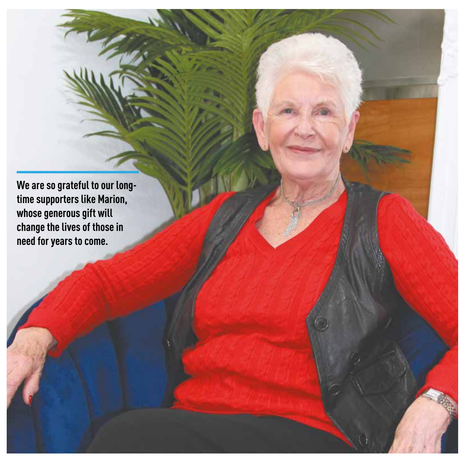
"It's the wonderful dedication of Vinnies volunteers that makes me want to help."