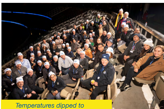
Temperatures dipped to eight degrees at Optus Stadium.

“The advocacy that business and community leaders can do beyond this event can have a lasting impact on the way we respond to homelessness as a society,” she said.