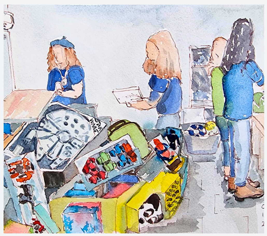
2023 Christmas Gift Wrapping sketch captured by Urban Sketchers